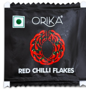
Red Chilli Flakes 0.7 g