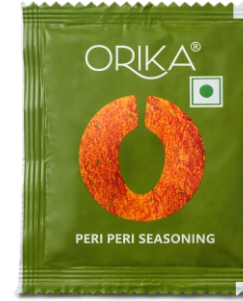
Peri Peri Seasoning 1.0 g