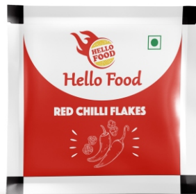
Red Chilli Flakes