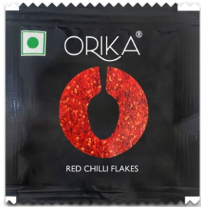
Red Chilli Flakes 0.8 g