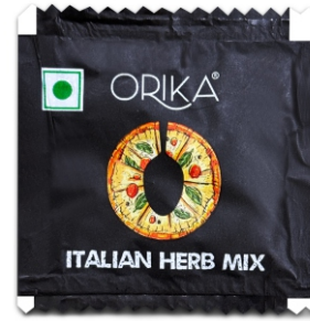
Italian Herb Mix 0.7 g