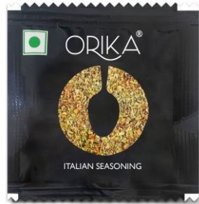
Italian Seasoning 0.8 g