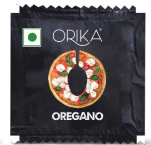
Oregano 0.4 g